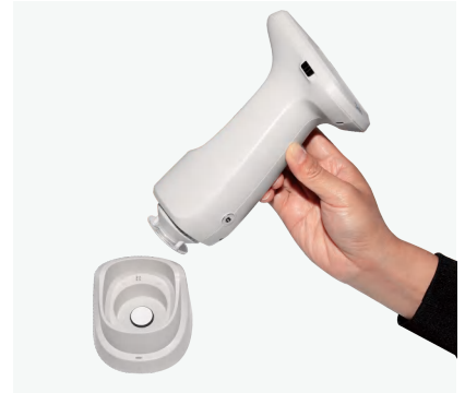
Non-contact automatic white calibration