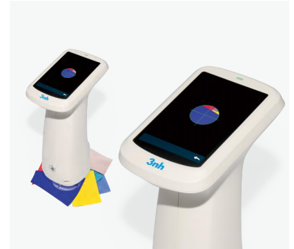
Camera viewfinder positioning