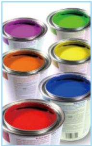
Paint & Ink